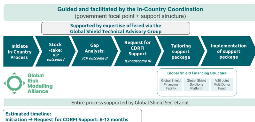
Figure 3: Global Shield In-Country Process

The support provided by the Global Shield is centred around a country-led, demand-driven In-Country Process with an interactive multi-stakeholder consultation. The Global Shield works with the Global Risk Modelling Alliance to assess climate risks, identify urgent financial protection needs, and request tailored support packages to close protection gaps. The entire process engages all relevant stakeholders: government institutions, development and humanitarian actors, the private sector, civil society and academia, including affected groups. The designated focal point of the lead Ministry heads the process as the In-Country Coordinator and is responsible for convening the key stakeholders and ensuring that In-Country Process outputs are finalised and endorsed.