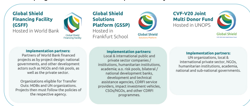
Figure 2: Global Shield Financing Structure

The Global Shield Financing Structure will work with different implementing organisations, NGOs, government institutions, private sector actors and humanitarian agencies, and